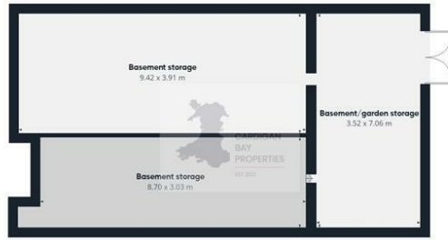
Floor -1 Building 1